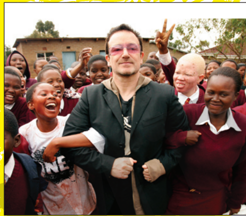
Bono sees it as simply doing the right thing...

Bono was first moved by starvation in Ethiopia, but he quickly realized the vast needs of the entire African continent. He learned that much of the population was impacted by AIDS, a disease that affects the immune system so that even a cold can lead to death. In Africa, where medical care is often meager, that means massive death tolls. "The facts about AIDS blow your mind," he says. "They also break your heart."